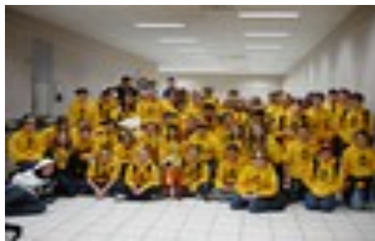
Lancer Regiment returns from San Diego after performing at the Holiday Bowl